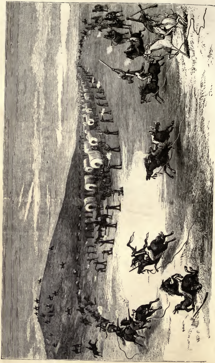
THE ATTACK UPON THE TRAIN.