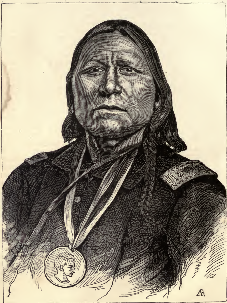
SATANTA, SECOND CHIEF OF THE KIWAS.