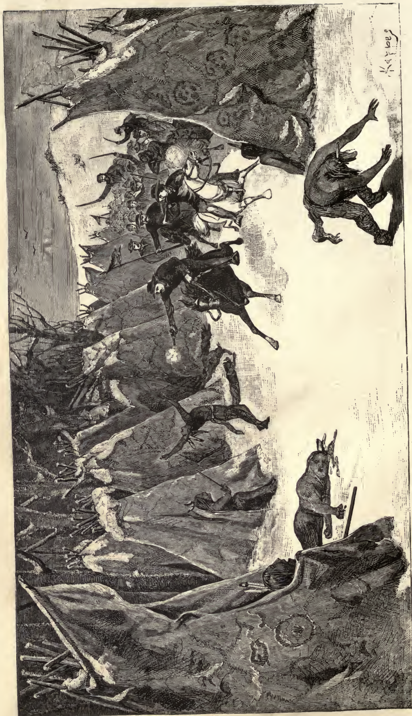
THE BATTLE OF THE WASHITA.