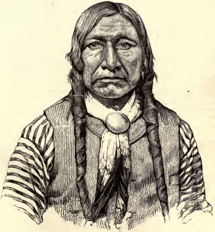
YELLOW BEAR, SECOND CHIEF OF THE ARAPAHOES.