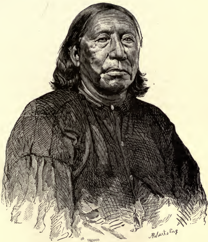
LITTLE RAVEN, HEAD CHIEF OF THE ARAPAHOES.